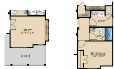
OPT. STUDY AT DINING