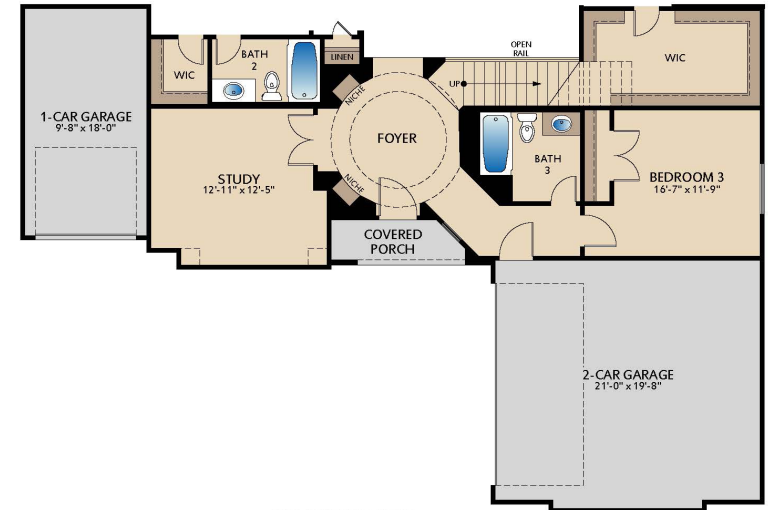
OPT. 3 CAR GARAGE