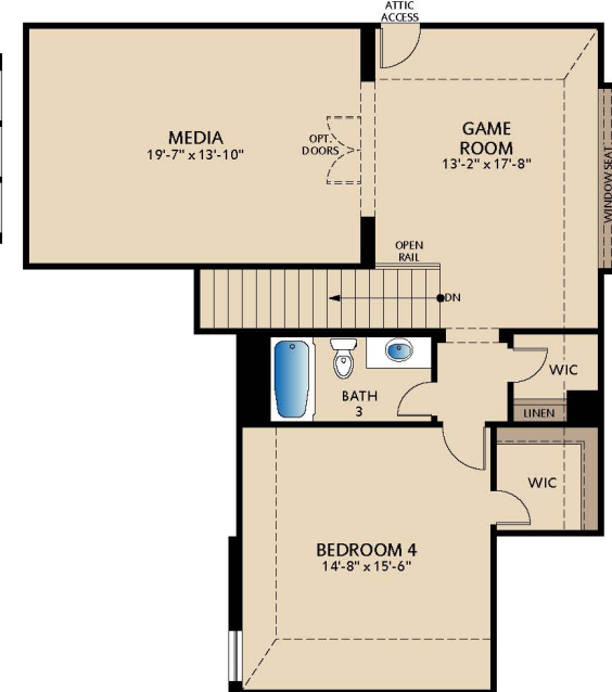
OPT. SECOND FLOOR W/ GAME ROOM, BEDROOM 4 & MEDIA